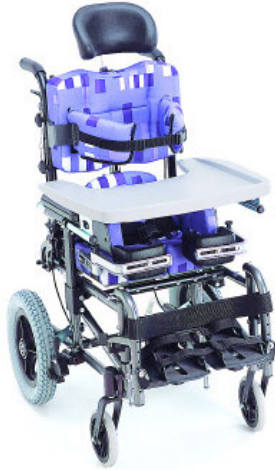
Mobile Advance Seat

Note: The serial number range is used across all models.