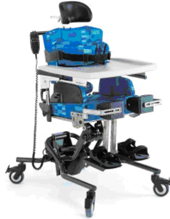
Contoured Advance Seat