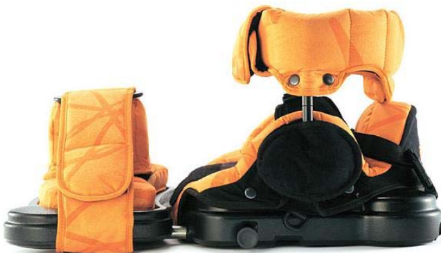
Squiggles Early Sitting System