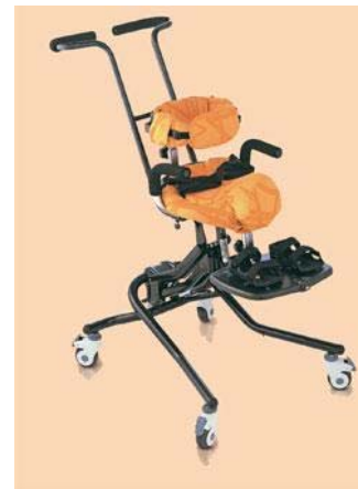
Squiggles Saddle Seat